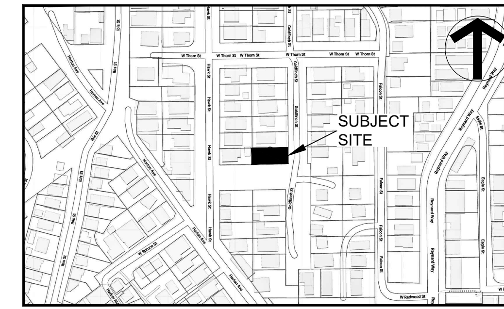
VICINITY MAP (N.T.S.)